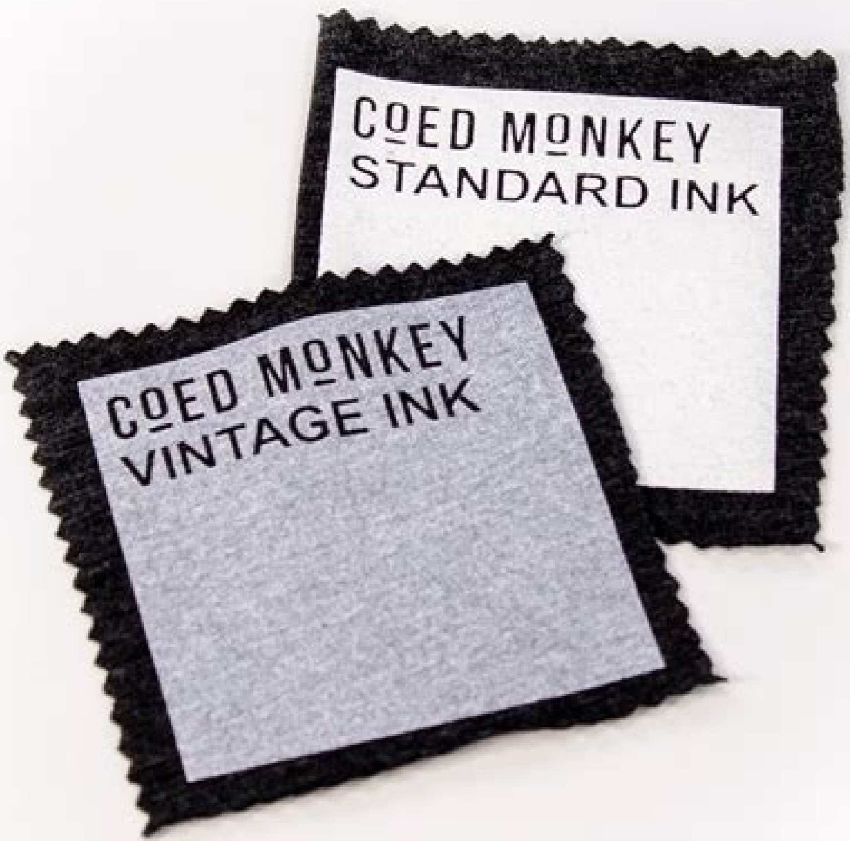
T shirt tech pack template free. Shirt tech pack pdf. T-shirt tech pack download.